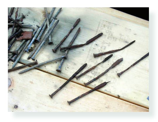
Corroded nails removed from deck boards.

The following checklists provide a few basic reminders of good inspection and maintenance practices applicable to most exposed wood structures. Of course, the best inspections are those done by knowledgeable contractors and building professionals who may notice things that the average homeowner may miss.