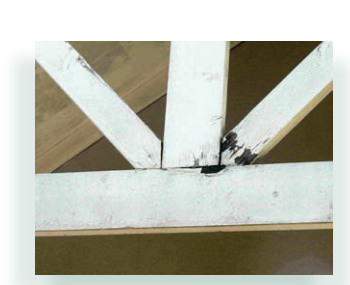
Open joints collect water and lead to deteriorated beams and columns at the connection.