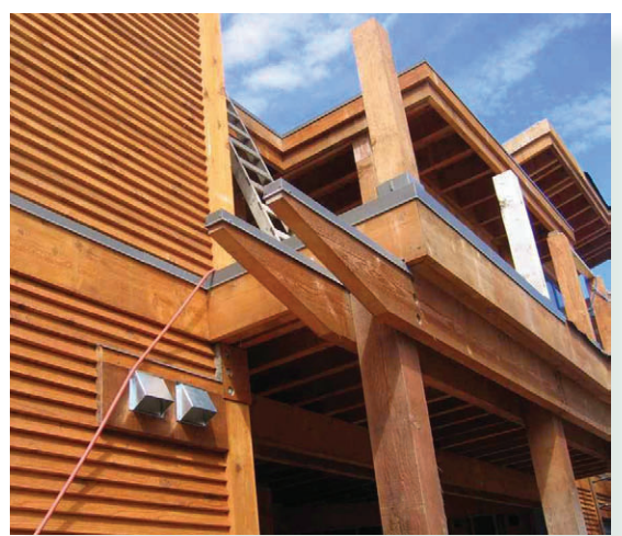
Metal cap flashing on exposed beam ends prevents water from collecting on the upper horizontal surfaces.