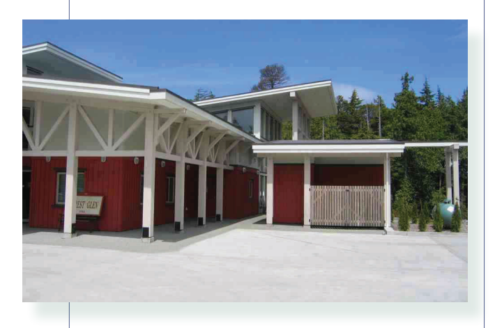
Roof or canopy structures minimize wetting of wood posts and beams.

Exposure to moisture may also be limited by the application of coatings such as paints or