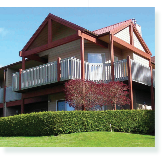
Exposed wood posts, trim, balcony guards and decks require regular maintenance to retain their appearance and function.

There is a long tradition of wood construction of residential buildings in British Columbia. Wood is valued for its strength, cost effectiveness and natural visual qualities. In addition to its use in structural framing, wood is used as a finishing and cladding material. Much of the wood used in buildings is concealed in walls and building interiors. However, in many buildings, wood elements are also used on the building exterior and are exposed to the environment. Examples of exposed wood elements include siding and trim, posts, decks, walkways, stairs, balcony guards and fences.