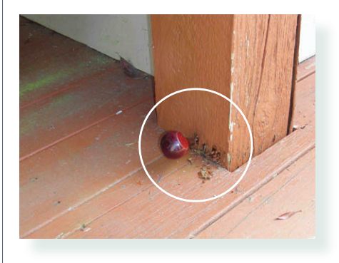
Probe reveals deteriorated wood post masked by solid stain.

As a general rule, recoating should be done when the previous finish is just beginning to show signs of aging, and before it loses its ability to protect the component. However, if the finish on particular components or portions of the buildings begins to show signs of deterioration earlier than others (because of differences in exposure or orientation) it may be appropriate to develop different recoating schedules. If recoating of wood is left too long, permanent damage may occur, and recoating at that time may not rectify the damage that has occurred. The frequency at which recoating should occur is dependent upon many factors including coating type and exposure conditions. A typical range of recoating frequency is two years for some clear coatings to seven years for some high quality paints.