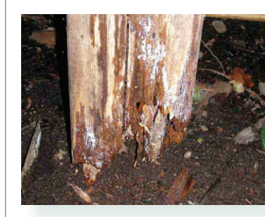
Deteriorated post in direct contact with soil.

Installation of boron rods at base of post will provide greater resistance to decay. Boron rod shown leaning against base of post and locations where installed are highlighted by white arrows.